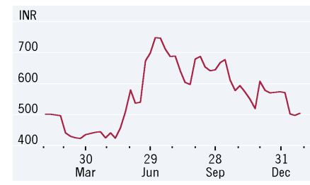
Figure 1. Statistical Abstract